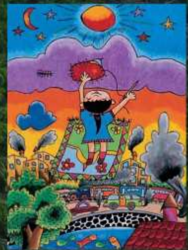
Credit: Laila Nuri, aged 8, Indonesia in UNEP's 1998 Children's Painting Competition